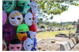
HIDDEN Rookwood Sculptures, will be back in 2020, bigger tha...