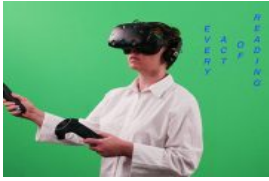
Monash University Museum of Art ...