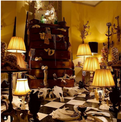
"House of Dreams" curated by Barking Spider Visual Theatre

What makes a visit to this museum a unique experience is that it is one of the few exhibition-houses in Australia to be unfettered by ropes and barriers and in 2020, the Collection celebrates its 30 th year of being open to the public. Its new exhibition, An Interior Life , will offer a more "traditional" interpretation of Johnston's vast and eclectic collection and allow visitors to see work by one of the greatest printmakers of the 18 th Century Giovanni Battista, a typewriter by its iconic founder Hidalgo Moya, and an exquisite longcase clock by one of the utmost inventors of the 18 th Century, Henry Hindle.