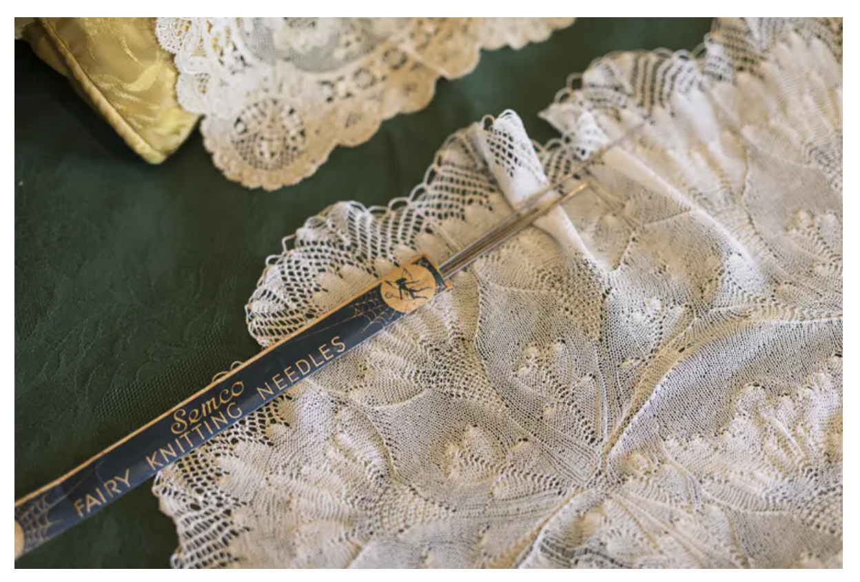
Three generations of the Collyer family contributed to the exhibition.

Nonetheless, it is questionable whether, in a #metoo climate pushing for women's voices to be heard, an all-male exhibition is appropriate.