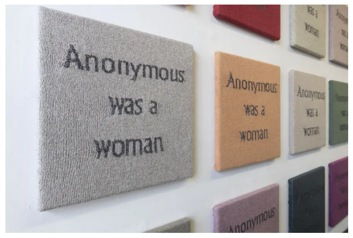
Anonymous Was a Woman by Kate Just.

The income gap between men and women is wider in the arts than the average gap across all industries in Australia. Research shows that artists earn a little more than a third of their income from their creative efforts, with women making an average of $15,400 from their art while men earn $22,100 from theirs.